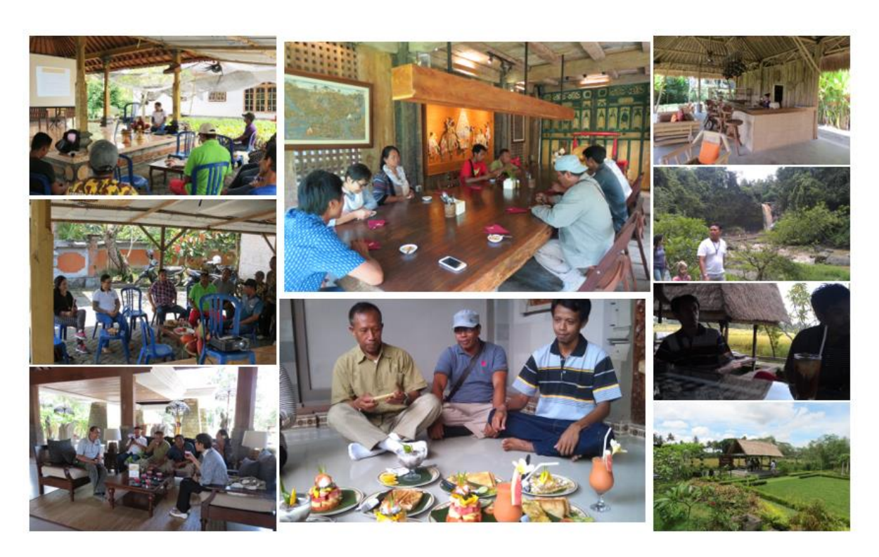
Figure 1: Activity photos - CBT Counseling, Comparative Study and Cooking class

The next action carried out is the measurement of the result of the activities which is to identify the understanding level of Pohsanten Village Tourism Development Team on CBT. The test results which can be clearly seen in Figure 2, are shown in Table 2. Overall, the test results are at an average of 1.7 points in the 'Strongly agree' range, which shows that the team member have a very good understanding of CBT. The average value of the five aspects of CBT also scores well below the 2. 'Tourist attractions' aspect obtains the best mean value of 1.6 which shows that the team understands the most about CBT attractions. There are 2 aspects that get a high score of 1.8 (but still below 2) which shows the lowest level of understanding among the measured aspects. The two elements are 'business aspects' and the 'the essence of CBT''. Both need to get more attention from the developer team.