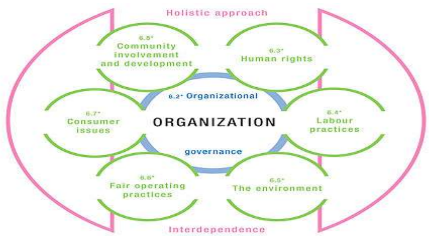
Figure 4. The ISO 26000 Structure

In the global order and also in Indonesia, the definition of social responsibility generally refers to the ISO 26000 Guidance for Social Responsibility document, namely responsibility of an organization for the impacts of its decisions and activities on society and the environment, through transparent and ethical behavior that contributes to sustainable development, health and the welfare of society; takes into account the expectations of stakeholders; is in compliance with applicable law and consistent with international norms of behavior; and is integrated throughout the organization and practiced in its relationships. The ISO 26000 structure has seven core subjects. Organizational governance becomes the main foundation for the implementation of the other six core subjects (see the following diagram). Then the other six core subjects are issues that are very relevant to organizational behavior.