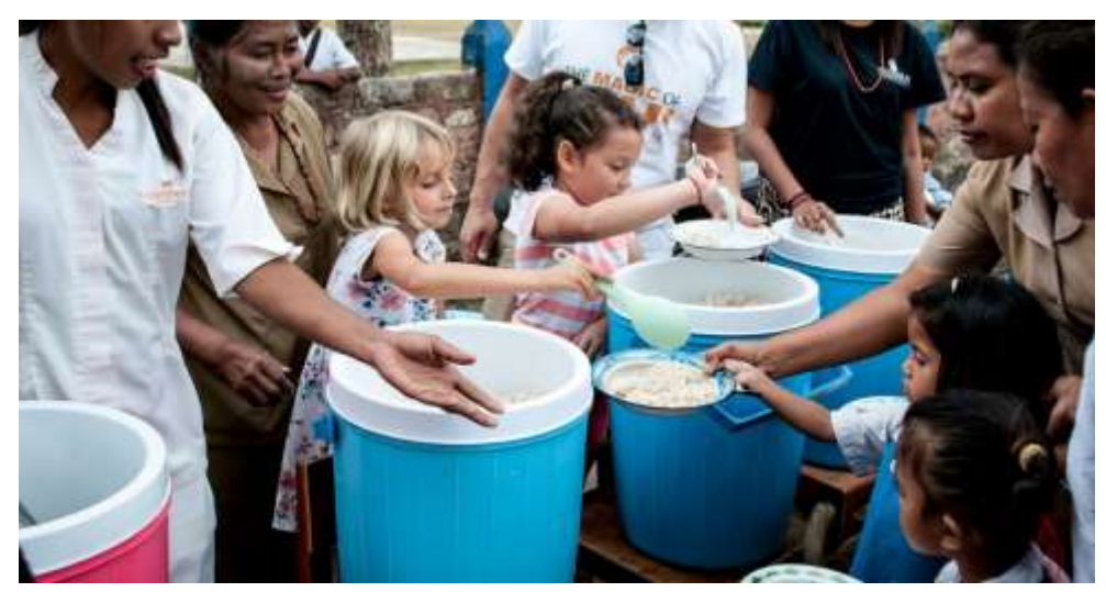
Figure 2. School Lunches Program

To handle the malnutrition cases carried out by the Sumba Foundation is by providing help with nutritious food sources such as milk, eggs, chicken, green beans, rice, cooking oil, vitamins and medicines, and the provision of healthy processed foods. School lunch programmer providing lunch to nearby elementary schools around Nihi Sumba Resort. Until now it has reached 10 elementary schools around the Resort, and currently expanding into 12 schools so far, including two schools in the Sodan valley, whose students are in desperate need of better nutrition and hygiene education.. The plan is the number of schools recipients of this program will continue to increase. The school lunch program is given twice a week, i.e. every Monday and Thursday.