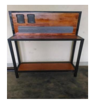
Figure 1. The Design of Solar Panel Modules

The data used in this study is the primary data in the form of Survey Panel output measurement results in series and parallel relationships conducted outside the Laboratory of Physics Department of Electrical Engineering Politeknik Negeri Bali