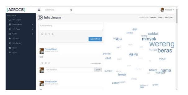
Fig 7. Public/General Page and Word Cloud