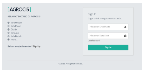
Fig 6. Sign In Page

After the first page (Fig. 6), the user will go to the main page that has a choice of various menus on the left column. Explanation of the main features of the application as follows: