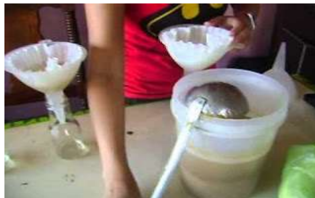
Figure 3. The process of making VCO in Sangkan Gunung Village

Another potential to be explored in Sangkan Gunung Village is the tour package for making VCO. So, tourists can follow the process of making VCO from the coconuts harvested on their trees in the village.