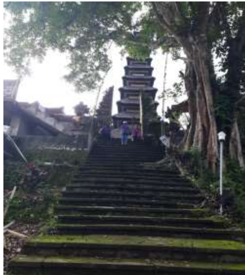
Figure 5. The Bukit Tegeh Temple surrounded by tropical forest and paddy fields

Not only that, Sangkan Gunung Village also has the Bukit Tegeh, of a very steep set of stairs (moreless 350 steps) that offers tremendous views, a scenic river flowing through the valley floor and ample opportunity for both trekking. While other spots are more convenient, visitors can organize an ascent of Gunung Agung from Sideman and just more easy-going wanders through the rice fields.