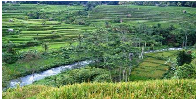
Figure 2. The view of paddy fields and Telaga Waja River

unmarked green gems is Sangkan Gunung Village. This village has a view of rice fields and Telaga Waja River as it is shown in figure 2.