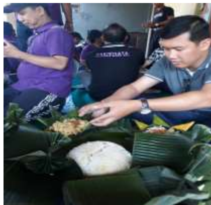
Figure 4. Green concept of “Megibung”

At the time of eating, as much as possible in order not to splatter, let alone scattered on the tray is not allowed. So, the impression does not eat the rest of the food sprinkling others. Even if the food is spilled, it must be outside the tray. Although there are no written rules in the traditions or megibung events, the megibung participants also should not spit, sputter, sneeze, yell, laugh loudly, etiquette and other manners, including when one megibung participants are full, cannot leave the place, start together and end together. To preserve this megibung event or tradition, on June 15, 2019, the Semseman Hamlet, Sangkan Gunung Village, held a megibung event in the hamlet village hall. It involved all components and layers of society and invitation from Tourism Department, Politeknik Negeri Bali for holding a social service in Sangkan Gunung village. In line with the implementation of green tourism campaigned by the Tourism Department of the higher vocational education is that the use of organic ingredients in making the Balinese cuisine and plastic free in serving the meal. Instead of using plastic, the green banana leaves is used to serve the typical Balinese tradition food as it is shown in figure 4.