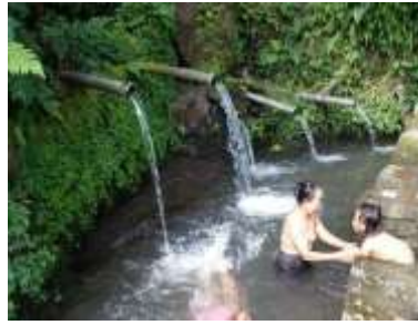
Figure 4. Purification Malukat ritual in the spring of Sudamala

Not only that, Sangkan Gunung Village also has the Bukit Tegeh, of a very steep set of stairs (moreless 350 steps) that offers tremendous views, a scenic river flowing through the valley floor and ample opportunity for both trekking. While other spots are more convenient, visitors can organize an ascent of Gunung Agung from Sideman and just more easy-going wanders through the rice fields.