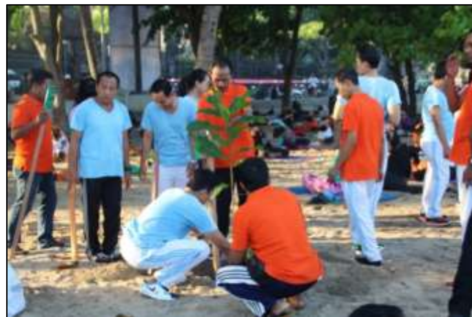
Figure 4. Trees Planting

Trees planting is also a form of caring for the environment currently planted on the coast. This activity is also routinely carried out although not as often as the scheduled beach clean-up activities at least once in a week. This tree planting activity is usually carried out on Friday to coincide with the beach clean-up activities to build a sense of "natural" owned by Kuta beach. This activity in the case of Tri Hita Karana entered into the relationship between human and the universe ( palemahan ). This green activity will be uploaded to social media to show that the company is care about the ecology. Besides, it will be a plus value for the company because tourist are most likely to visit the hotel that has been doing green practices (Manaktola and Jauhari 2007).