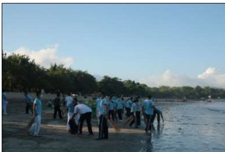
Figure 3. Beach Clean-Up