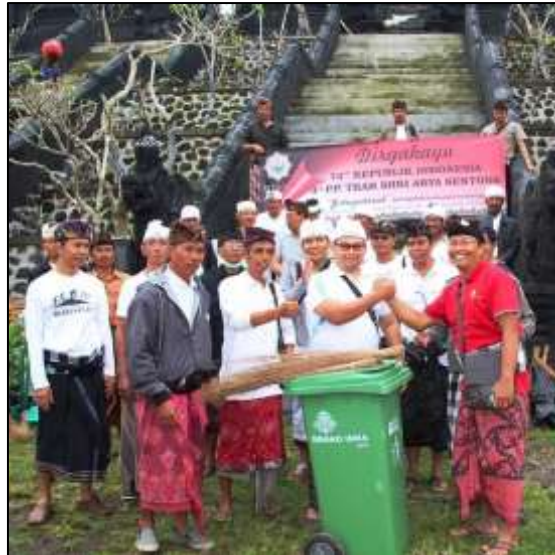
Figure 5. Social Assistance

Social assistance activities during the pandemic namely CoVid-19 virus made Grand Inna Kuta move to carry out social assistance activities ( pawongan ). Although the Grand Inna Kuta has given tribute to the traditional village of Kuta, but, activities to help together during the ongoing pandemic also carried out against a background of understanding many parties, especially those working in the tourism industry lost their jobs causing a lack of food in addition, there are also parties who still have to work even though there is a pandemic because the salary is in the form of daily. Therefore, seeing the presence of a CoVid-19 integrated unit officer or post in Kuta, Grand Inna Kuta swiftly provided social assistance that would be distributed by the integrated post officer. According to the result of (Holcomb, et al, 2007) most of the hotel company do corporate social responsibility activities that is related to charitable donations. The social assistance is a good activity however, during the pandemic of covid-19, Grand Inna Kuta internal staff got unpaid leave, in the other hand, Grand Inna Kuta done the charity that affected by covid-19. Though in the end, Grand Inna Kuta provides food for internal staff which can be taken at the hotel's cooperative.