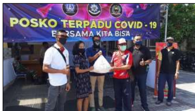
Figure 6. Social Assistance During Pandemic