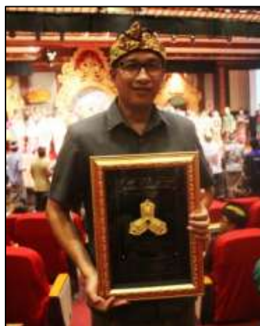
Figure 7. Tri Hita Karana Award

Those corporate social responsibility activity is a small example of what Grand Inna Kuta has done. The activity is carried out consistently and does have its own agenda. In addition to proof the CSR program that held by Grand Inna Kuta corresponds to local culture Tri Hita Karana, Grand Inna Kuta won the Tri Hita Karana awards organized by the Tri Hita Karana Bali Foundation which was held in Denpasar. Grand Inna Kuta won the Emerald class 1 for 4 stars hotel. This shows that corporate social responsibility based on local culture that Tri Hita Karana is going well so that it can reach Emerald 1.