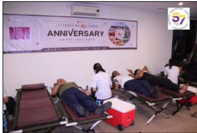
Figure 2. Blood Donor

The purpose of this blood donation activity is to help the blood transfusion unit namely the Indonesian Red Cross (Palang Merah Indonesia) and increase the sense of social care from hotel staff to be more motivated to help and share together. The philosophy of blood donation is blood donation constitute the easiest way to share in life. The deepest philosophical meaning, blood donors show that we live does not discriminate against anyone, because with blood donors to share life with all those who need it.