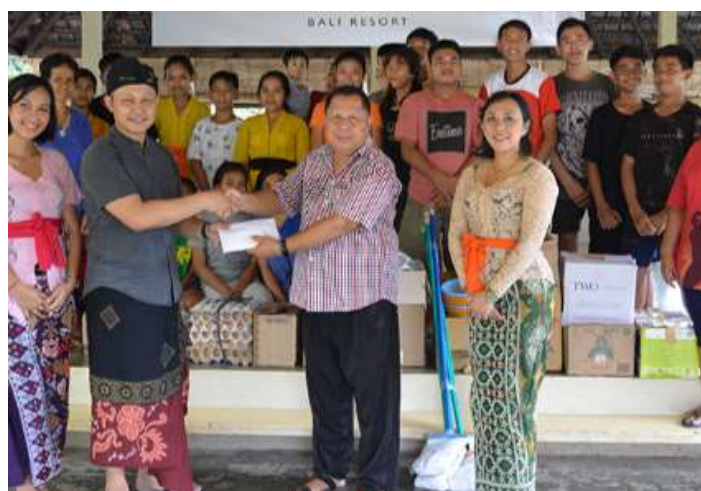
Figure 3. Embrace the Joy of Giving

After two months, the funds were collected 14,3 million rupias, 8,3 million rupiahs in cash as donated by guests and employees, while 6 million in goods as contribution by the resort. The festive season is a season of sharing the joy with others. This year, we are grateful that we can continue to celebrate the true spirit of the festive season by sharing our happiness with those unfortunate children. This acts as the true implementation of the three-cluster regulation and the activity will be shown in Figure 3.