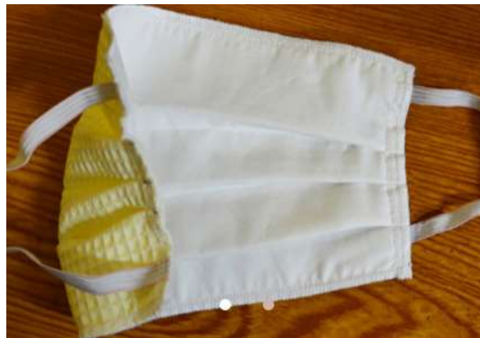
Figure 2. The homemade face mask from InterContinental Bali Resort