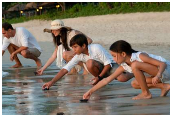
Figure 4. Give A Little, Save A Life

InterContinental Bali Resort is actively conducting a social awareness initiative to give back to the local community by working closely with several appointed foundations and more on various projects. To support this initiative, the resort invites guests to participate in the 1 (One) Dollar Donation program where every USD 1 (one) per night guest contribution will be donated through the programs. Alternately, the resort offers guests an opportunity to donate privately to any of the above organizations if they wish. This has inline with the governor and the (international, national, and local) law and regulation to safe and helps others. These activities will be shown in Figure 4.