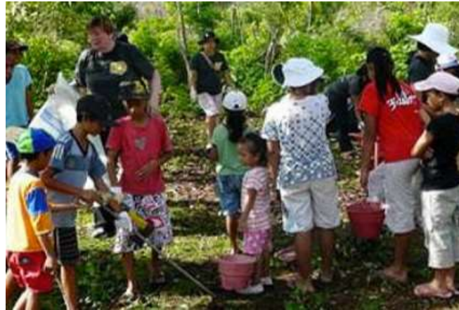
Figure 6. IHG Earth Week

These findings are related to the Law No. 10 of 2009 concerning Tourism (Undang-Undang Kepariwisataaan) Article 26 requires tourism entrepreneurs to be responsible for maintaining a healthy, clean and beautiful environment and maintaining the preservation of the natural and cultural environment. This company aware of sustainable business, they should take more concern for environmental health, clean, and beauty. This action is related to the local regulation low number 6 of 2013 regarding corporate social responsibility in Badung regency. In the article 1 part, 5 was stated corporate social responsibility, hereinafter abbreviated as TJSP, is the obligation of every company to finance and/or facilitate Local Government Programs related to improving the quality of people's lives in the social, economic and natural environment based on the principles of equality and justice. This acts as the implementation to keep the environment for social life sustainability.