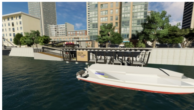
Figure 3. Shelter Plan (B)