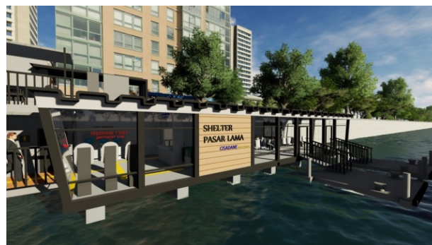
Figure 4. Shelter Plan (C)

The boat planned is a passenger boat with a capacity of 50 seated passengers + 18 standing passengers with a maximum speed of 30 knots.