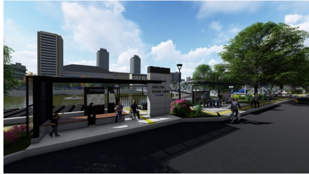
Figure 2. Shelter Plan (A)

River transportation on the Cisadane River (Cisadane Waterway) is planned to be on the Cisadane River flow path in Tangerang City along +/- 11 km from the upstream river at the border of Kota Tangerang and Kota Tangerang Selatan downstream at the Pasar Baru Dam. There are 6 shelters planned with the initial operation of 5 boats.