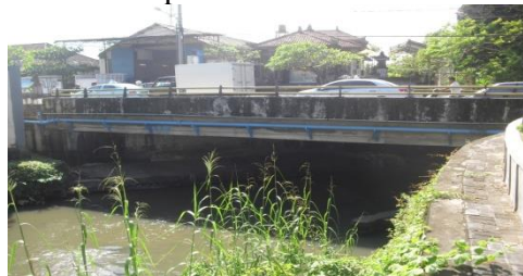
Fig 6 Nakula bridge

Nakula street bridge is located in the area of Legian located in the international tourism area of Kuta. This bridge became a contributor to the flood and puddles that flooded the region. The current width of the Nakula bridge is 13 m. The location of this bridge is in the downstream part of the Mati river so it has a very flat slope so that the water speed becomes low. Low water speed coupled with a short bridge width then the rainy season when this section becomes one of the flood points that exist in Mati river.