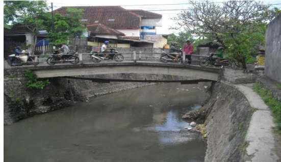
Fig 1 Resimuka Bridge