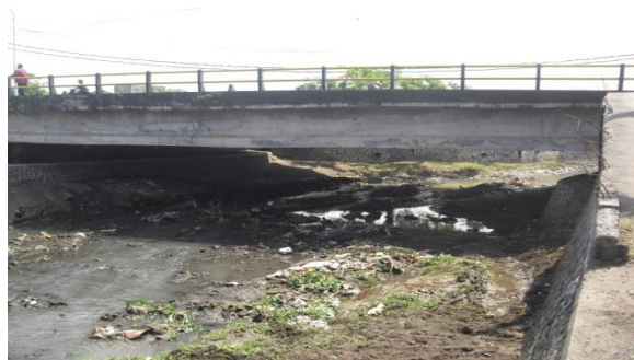
Fig 2 Buana Raya bridge

Condition of Buana Raya road bridge its position is behind the Bridge Resimuka. In addition to the narrow bridge width the position of Jalan Buana Raya bridge is located in the bend area so that it implies the decrease of water speed. With a width of only 11 meters and is located in the bend area then this position becomes a contributor to the flood point in Mati river. The suggestion that can be submitted is the widening of the bridge from the width of all 11 meters to a width of 15 meters. Problems in the widening of this bridge is constrained by the surrounding land is already full of buildings and surrounding temples stand. With conditions like this then the land acquisition becomes difficult to do.