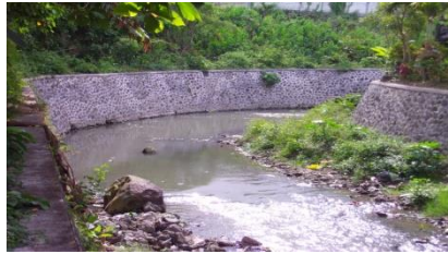
Fig 8 Sedimentation