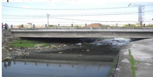
Fig 3 Teuku Umar Barat bridge

This bridge is located in the upper reaches of Dadas dam with a crossover position on Teuku Umar Barat street. The width of the existing bridge is actually quite adequate with a width of 23 m. But the problem arises because the height (clearance) that there is very limited that is 1.5 m. In this area there is a very high sedimentation due to the dam at the downstream of the bridge. With this limited height this segment can not immediately drain the water in case of flooding. Floods in this area will soak the existing settlement area on the road Pura Demak . Clearance required at this point is 2-2.5 meters