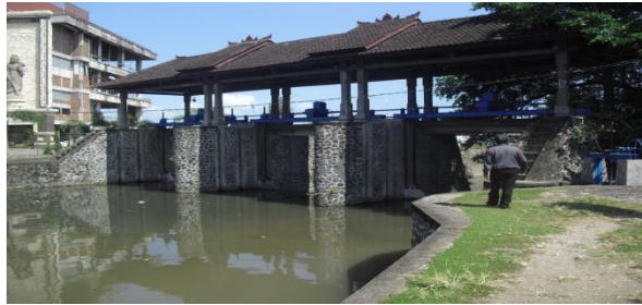
Fig 4 Umadwi dam

Currently Umadwi dam have a width of 18 meters and is a weir motion of the previous is a fixed dam with the construction of stone pairs. With the construction of a weir of motion, it gives more flexibility in the water regulation especially when there is a large discharge that requires rapid elevation. From the observation and analysis done then the ideal width required for umadwi weir is about 24 meters.