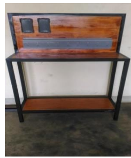
Figure 1. The Design of Solar Panel Modules

The data used in this study is the primary data in the form of Survey Panel output measurement results in series and parallel relationships conducted outside the Laboratory of Physics Department of Electrical Engineering Politeknik Negeri Bali