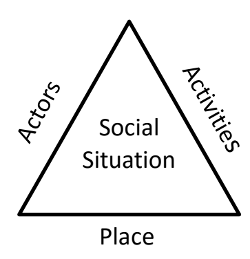
Picture 1: Soshum Issue (Vol 8 No 1, 2018) Spradley, P. J. (1980). Participant Observation p: 40 [source]

the activities, and the place. The three elements were expanded into nine observable dimensions (1) the physical place- space , (2) the people involved- actors , (3) the actors' activities - activities , (4) objects physically visible- objects , (5) actions of the actors - acts , (6) happenings or activities caused by the people who are in the place - event , (7) the sequences that are always present festival-goers one time to another- time , (8) that which is to be achieved - goals , (9) emotions that are felt and expressed- feelings . Spradley's description of the undergoing social situation can be seen in Picture 1.