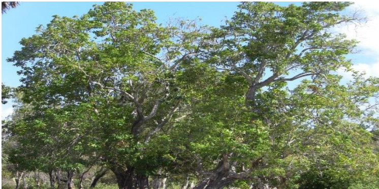
Picture 24: ai piko Field Work in July 14 th -15 th , 2020 by Toni, Nurak & Sombo [source]

The use of the plant as a building material is common almost everywhere. Using plant-based building material is advisable as it may help reduce global warming and support energy savings (Amziane & Sonebi, 2016). For most people who live in rural areas, including Landu people, the plant-based building material is more accessible than metal-based building material. The following is a kind of plant that grows in Lake Danau laut Mati Tasi Ana's area.