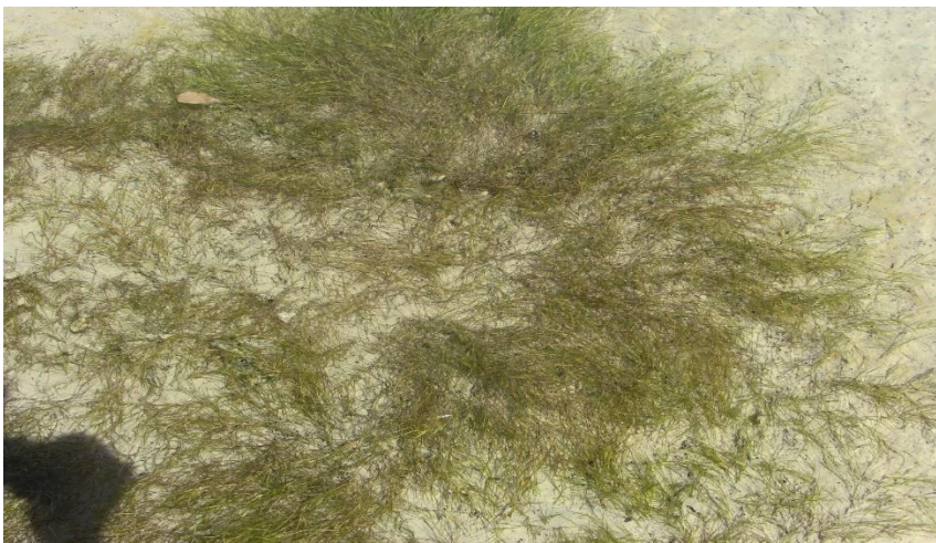
Picture 12: nau tasi Field Work in July 14 th -15 th , 2020 by Toni, Nurak & Sombo [source]

Lamudo [lamudɔ] is a kind of seagrass. It grows in the water. It is the feed for deer.