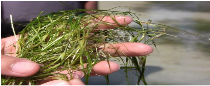
Picture 11: lamudo Field Work in July 14 th -15 th , 2020 by Toni, Nurak & Sombo [source]

As living things, animals also need food to sustain life. They adapt themselves to the environment where they live by. Lake Danau Laut Mati Tasi Ana' provide a variety of food derived from different floras and faunas as named in Landu Dialect of Rote Language as follows: