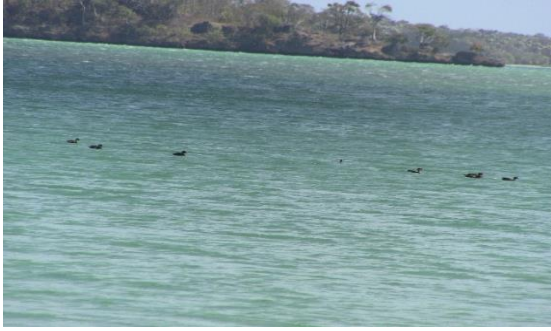
Picture 10: temei Field Work in July 14 th -15 th , 2020 by Toni, Nurak & Sombo [source]

Temei [təmei] is a kind of swan. It also eats fish. Like payaka it is also edible.