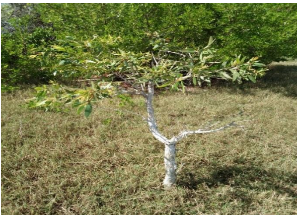
Picture 23: ai kela Field Work in July 14 th -15 th , 2020 by Toni, Nurak & Sombo [source]

Ai bau wana [ai bau uana] is literally translated as a small bau tree. Its leaf can be used to cure the wound.