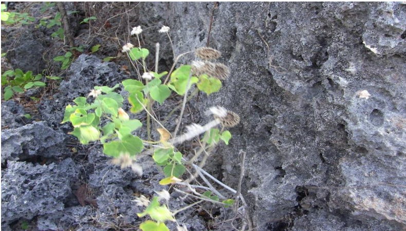
Picture 22: ai bau wana Field Work in July 14 th -15 th , 2020 by Toni, Nurak & Sombo [source]

Patola nura [patola nura] is literally translated as jungle patola ( nura =jungle). It is used to clean toxins from our body.