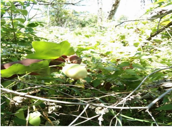
Picture 21: patola nura Field Work in July 14 th -15 th , 2020 by Toni, Nurak & Sombo [source]

Patola nura [patola nura] is literally translated as jungle patola ( nura =jungle). It is used to clean toxins from our body.